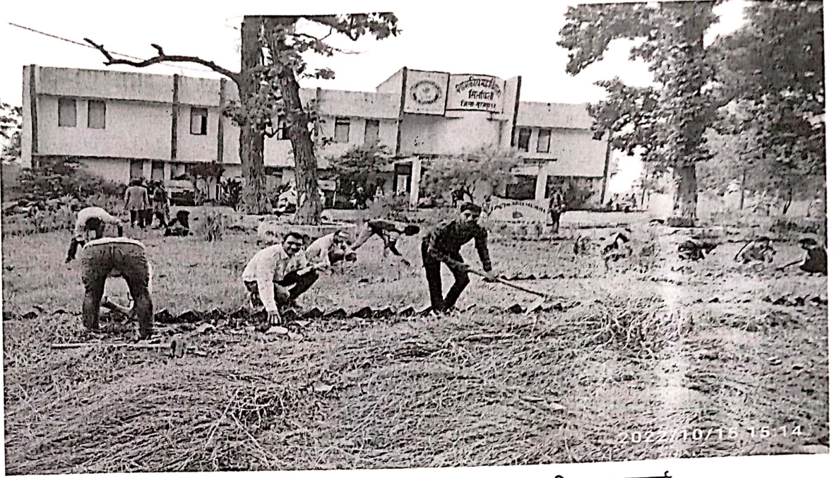
महाविद्यालय भवन के सामने विकसित उद्यान की साफ सफाई