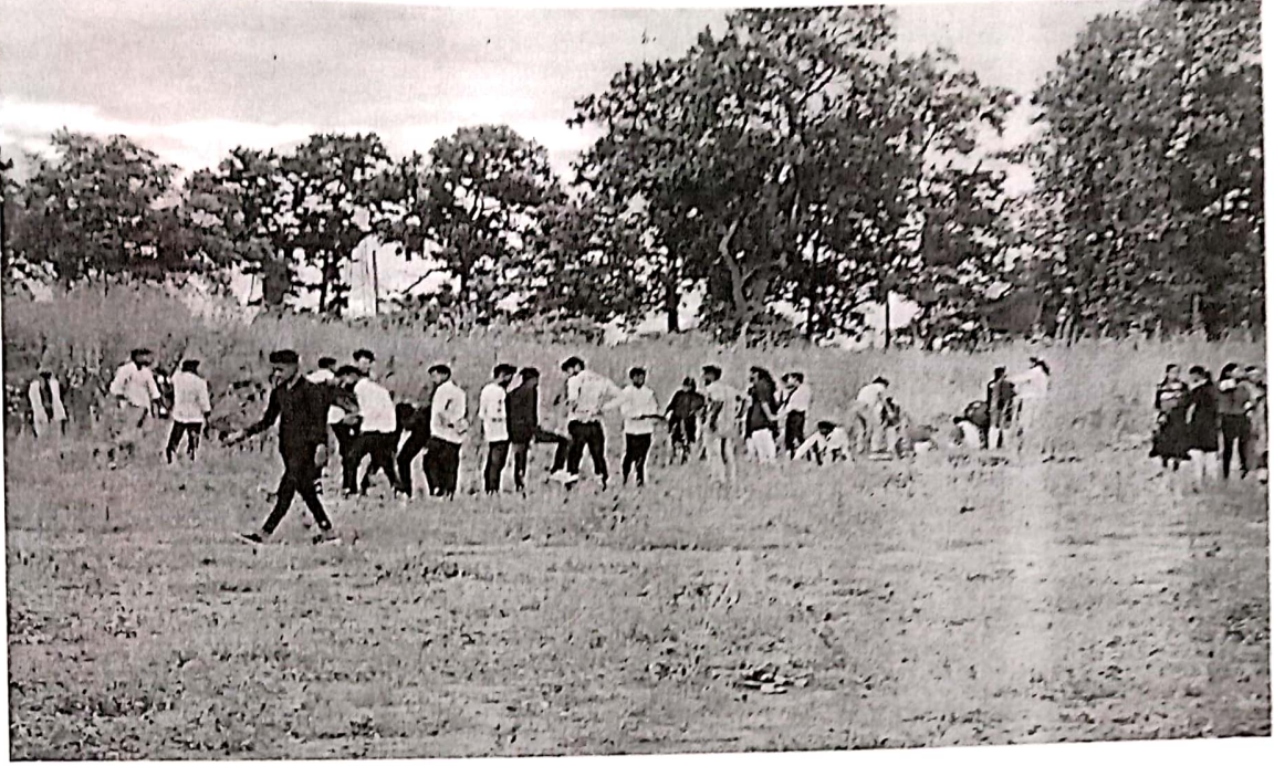
खेल मैदान की सफाई करते छात्र