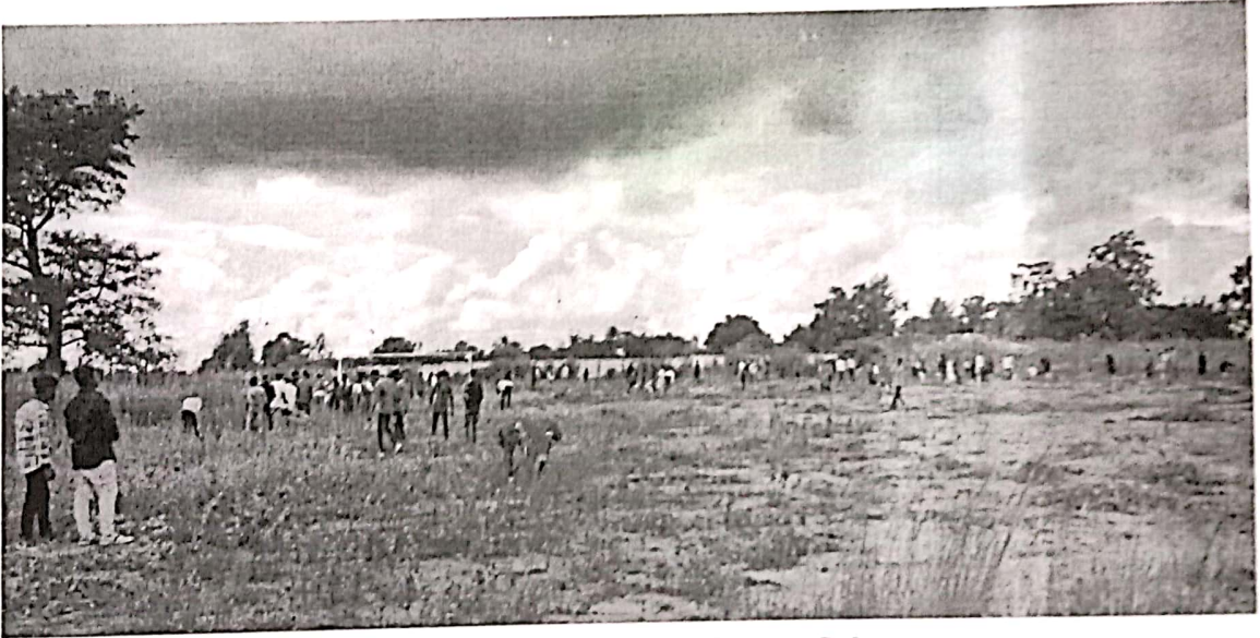
साफ सफाई कार्य का प्राध्यापकों द्वारा निरीक्षण