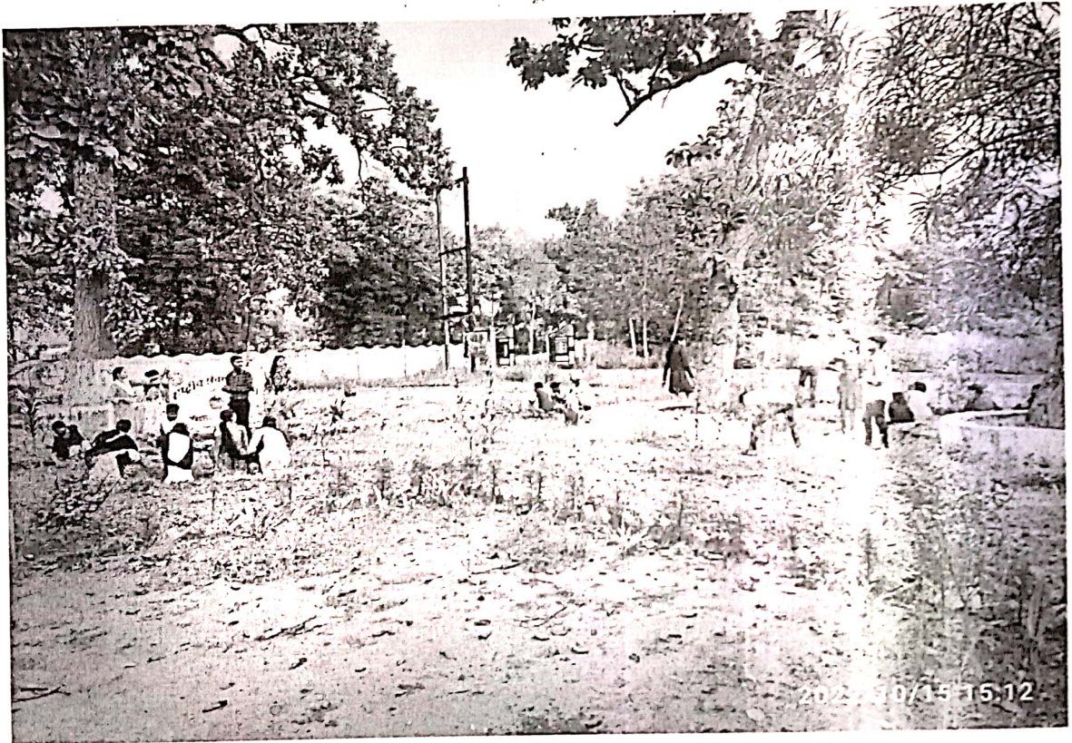
साफ सफाई कार्य का प्राध्यापकों द्वारा निरीक्षण तथा मार्गदर्शन